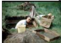
The cemetery at the Colonel Lewis B. Smith Site in Sandwich Notch was mapped by students in the summer of 2008