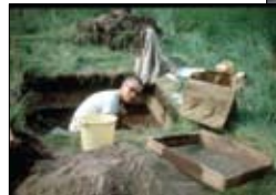
The cemetery at the Colonel Lewis B. Smith Site in Sandwich Notch was mapped by students in the summer of 2008